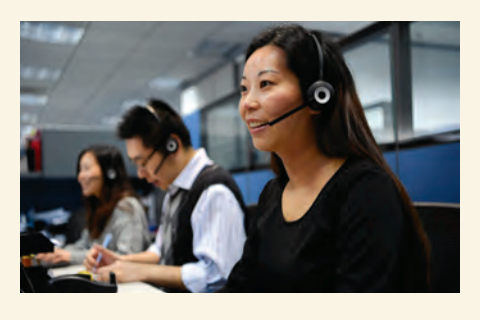
Integrity We are honest, fair and transparent.

Service Excellence We are committed to extraordinary performance.